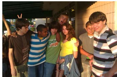
Confirmation golfing party

God has indeed blessed us. Great things are beginning to happen already! Thanks be to God!!!